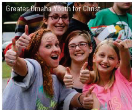
Greater Omaha Youth for Christ